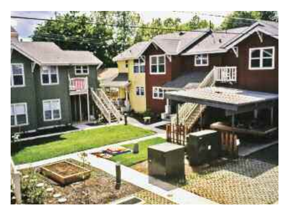
Southside cohousing courtyard, Sacramento, California.