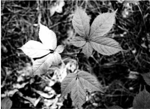
Third-year plant with typical three-pronged leaf development.