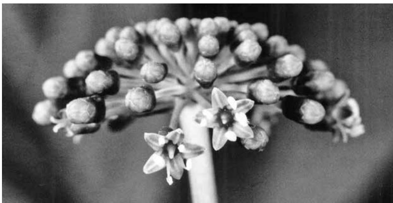
Flower spike beginning to blossom in early summer.