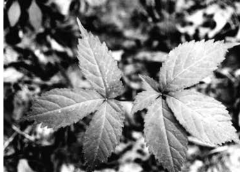
Second-year plant with typical two-pronged leaf development.