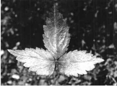
American Ginseng ( Panax quinquefolius ) during its first summer of growth.